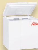
Steca PF 166 Solar refrigerator / freezer 12 / 24 V